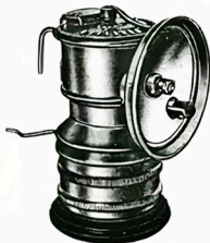
Premier Lamp No. 85